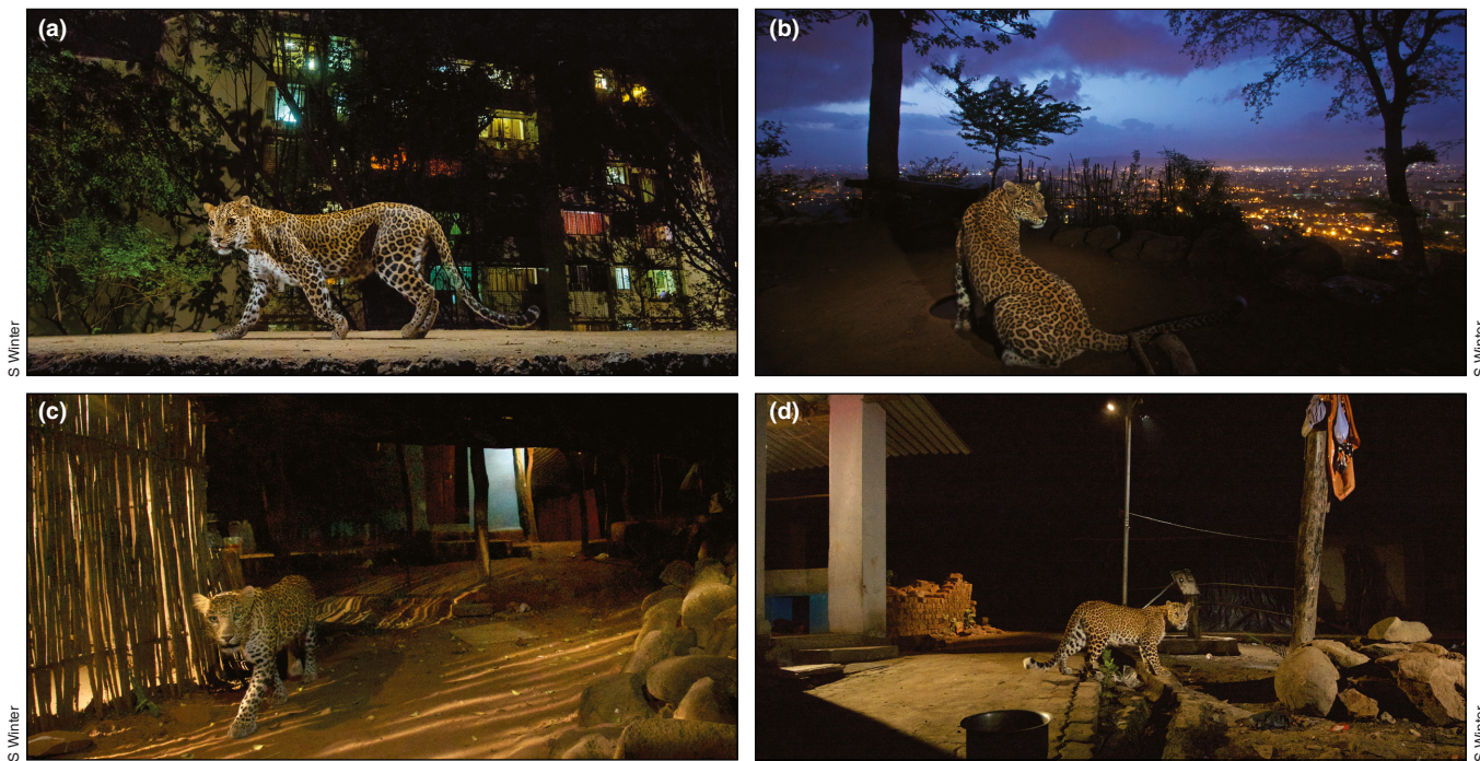
Figure 1. Leopards in Mumbai's Sanjay Gandhi National Park (SGNP) regularly leave the confines of the park to hunt stray dogs. (a) An adult female near an apartment block bordering the park's eastern edge; (b) a female at a Muslim sacred site overlooking the city of Mumbai; (c) a young leopard walking through a village in the Aarey Milk Colony; and (d) a young leopard at a construction site in an informal settlement.

is slowly being encroached upon by some of the largest slums in Mumbai, and at present approximately 250,000 people are estimated to live within just 500 m of the park's borders (K Tiwari pers comm; Prasad and Tiwari 2009), with an additional 100,000 people living in and around Aarey (P Variyar pers comm; WebPanel 1).